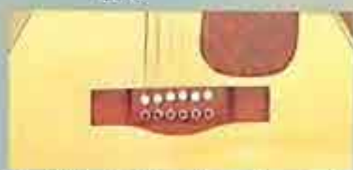
The GOYA patented and exclusive separate adjustable bridge screw saddles.